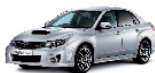
WRX STI range from £32,995

The unique layout of a boxer engine and permanent Symmetrical All-Wheel Drive affords a safer and more dynamic driving experience. So whether you're out driving in the rain or having to gallop to a meeting, a Subaru can handle it.