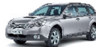
Outback range from £26,855

CALL IN OR CALL US TODAY TO ARRANGE A TEST DRIVE.