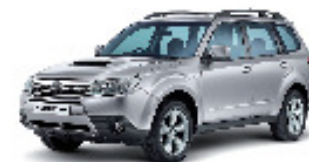
Forester range from £21,355