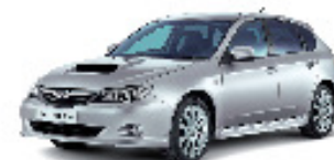
Impreza range from £17,405