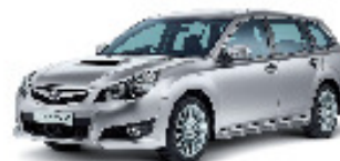
Legacy range from £21,995